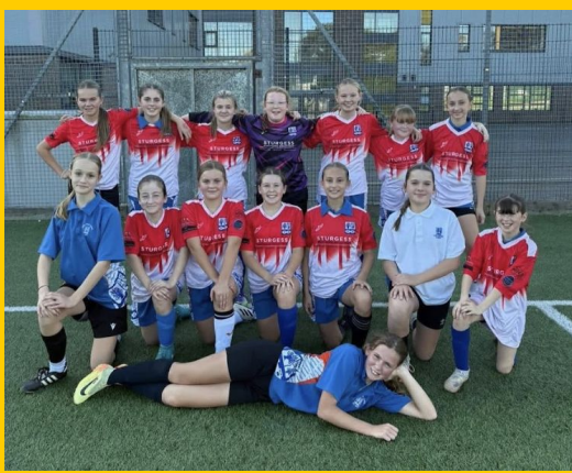
U13s Girls Football - Fixtures against Morrision

This term has been packed with sporting success—too much to include in full—but here are some of the highlights: