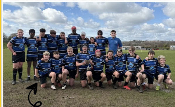
Huge congratulations to our Year 8 rugby team who won the Swansea Cup Final, beating Bishopton 32-17!